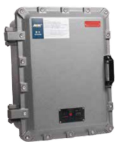
Power supply unit

Important notice: unroll completely before use!