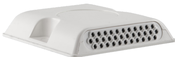
Road markers MarkFIX